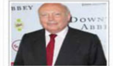
Julian Fellowes Explains Why a Sixth Season of Downton Abbey Will Be Its Last