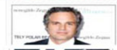
Mark Ruffalo Thinks He Could Take Jason Statham