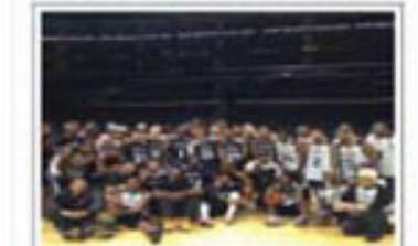
A Guide to Who Went to Kanye's Birthday Party