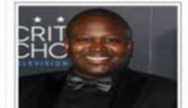
Tina Fey: Tituss Burgess Sang Pinot Noir 'On a Spot,' Which Is Why He's Awesome, Obviously